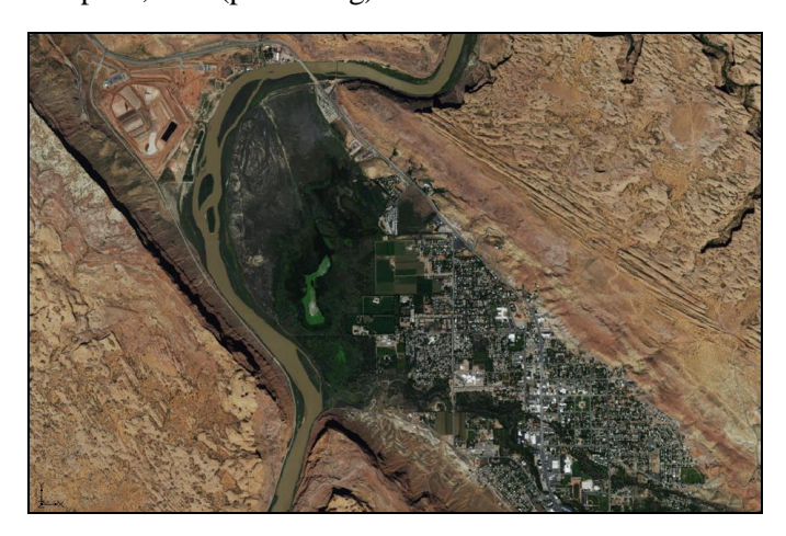
Figure 1 Online satellite map of Moab, Utah

Notice the icon for the online map item in the Project Explorer looks like the typical image item icon but with the addition of a globe in the bottom right corner, indicating it is an online map. As the image is downloading from the internet, the text next to the item in the Project Explorer will change to "(processing) World Imagery". Once the download is complete, the "(processing)" is removed.